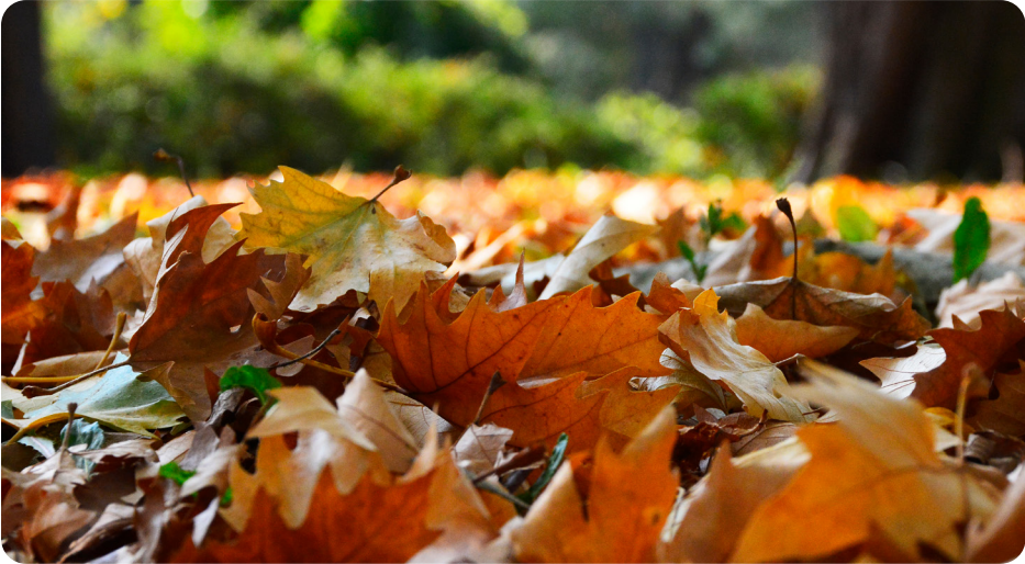
Autumn is the time of year when leaves change colour and fall from the trees.