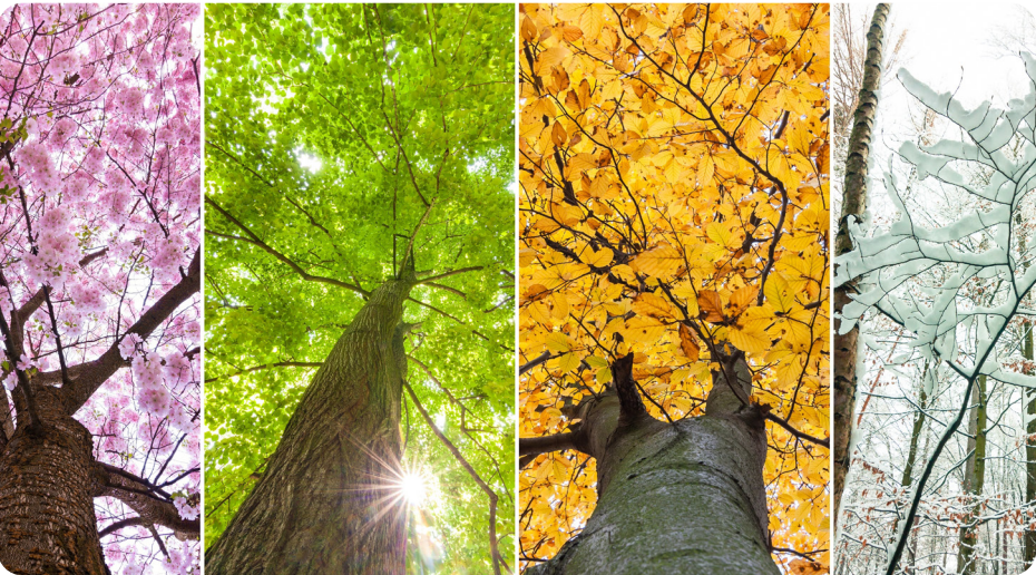
There are four seasons. They are spring, summer, autumn and winter.