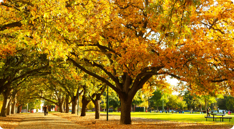
Autumn is a season.