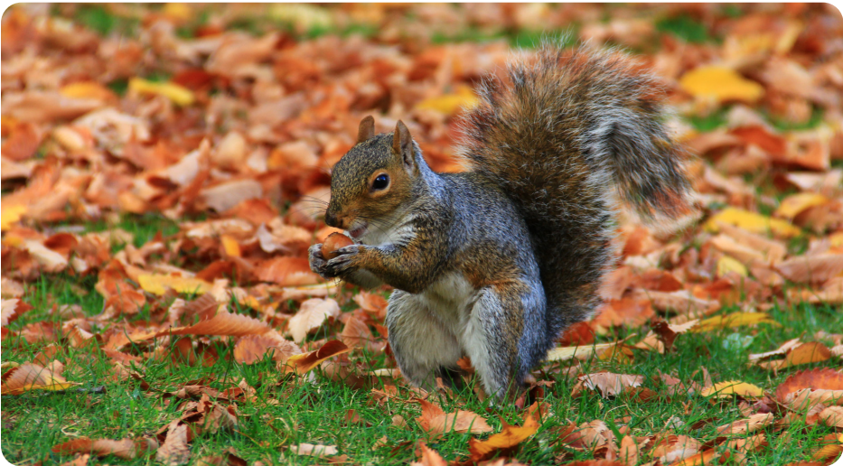
Some animals collect food ready for winter. Squirrels collect nuts, such as acorns, which they bury underground until they need them.