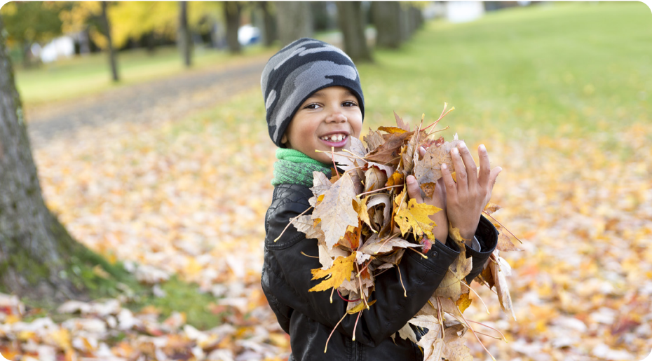
In autumn the weather starts to get colder and the days get shorter.