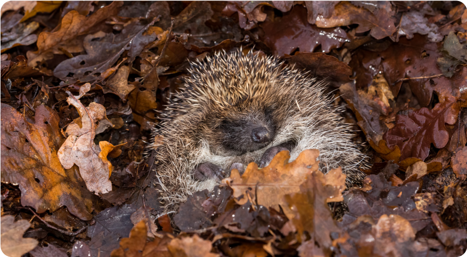
Some animals, like hedgehogs, get ready to hibernate. This means they will sleep through the cold winter.