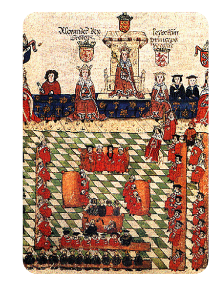
Edward I and the Model Parliament

The power of the monarchy has changed over time. In the past, some monarchs had absolute power. This meant that they could do whatever they wanted. Today, there is a constitutional monarchy. This means that the monarch is controlled by parliament and the government.