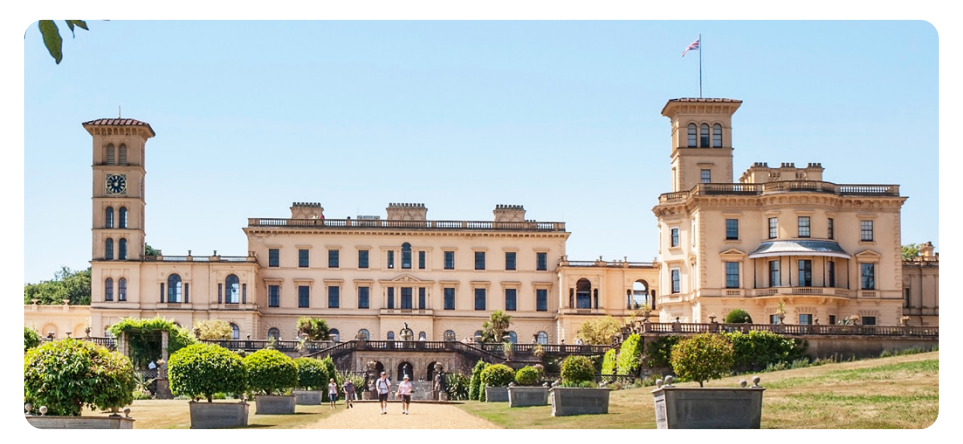
Osborne House is on the Isle of Wight, England.