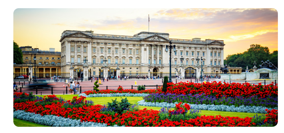
Buckingham Palace is in London, England.

Royal residencies include palaces, castles and stately homes. Some of them are used for official royal business. Some are used as holiday or private homes. Many are tourist attractions.