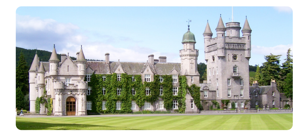
Balmoral Castle is in Aberdeenshire, Scotland.