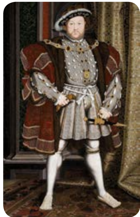
Henry VIII by Hans Holbein the Younger, 1537–47