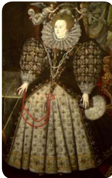
Portrait of Elizabeth I of England attributed to Nicholas Hilliard, 1590