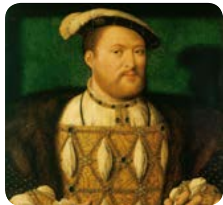
Portrait of Henry VIII by Joos van Cleve, c1530–1535

A portrait is a painting or photograph of a person. It usually shows their head and shoulders, but may show their whole body. Before cameras were invented, kings and queens often had official portraits painted to show how powerful and important they were.