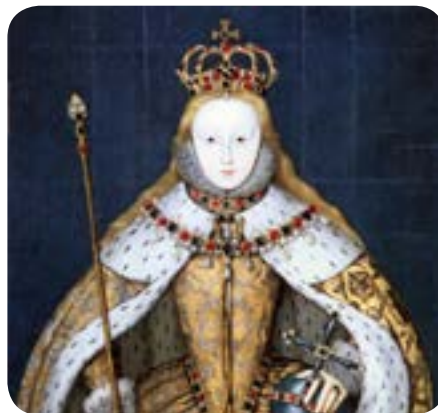
Coronation Portrait by unknown artist, c1600