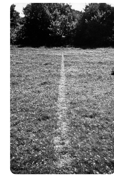
A Line Made by Walking by Richard Long, 1967

Land art can be made from many materials. Some artists sculpt the land into pieces called earthworks. Other artists use natural materials, such as twigs and rocks, to make sculptures within the landscape. Land art may be temporary, such as A Line Made by Walking. Richard Long made this line in the grass by repeatedly walking backwards and forwards.