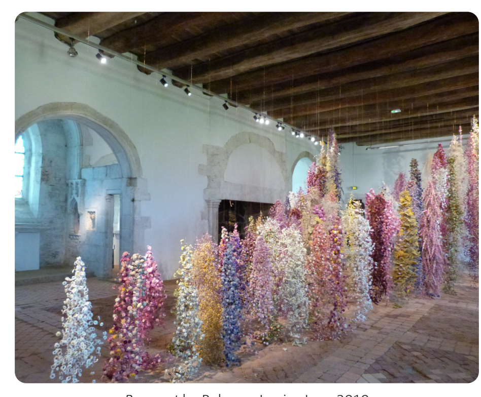
Banquet by Rebecca Louise Law, 2019

Some land artists bring materials inside from the outdoor environment to create installations in galleries and exhibition spaces.