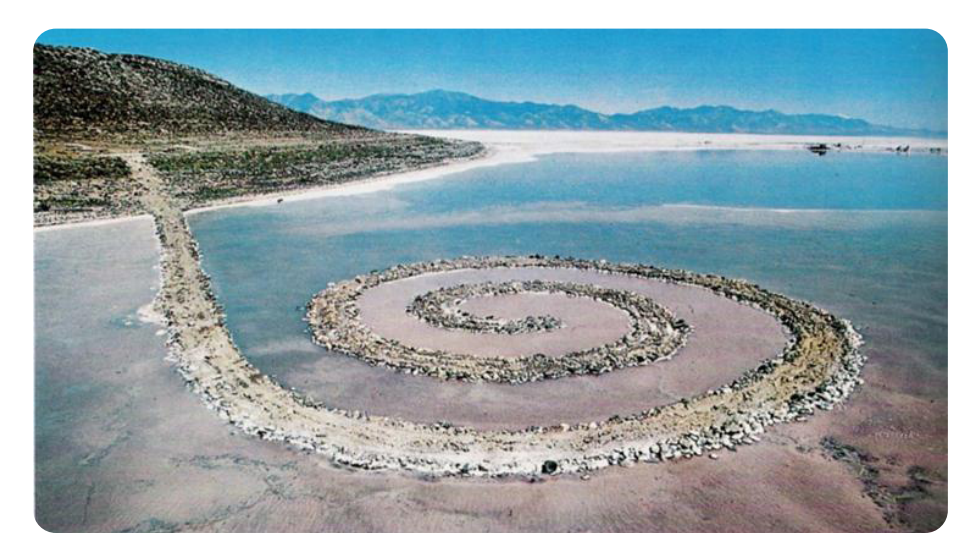
Spiral Jetty by Robert Smithson, 1970

Land art, or Earth art, is art that is made within the landscape. Land art is usually captured using photography because it is temporary and often made on a large scale.