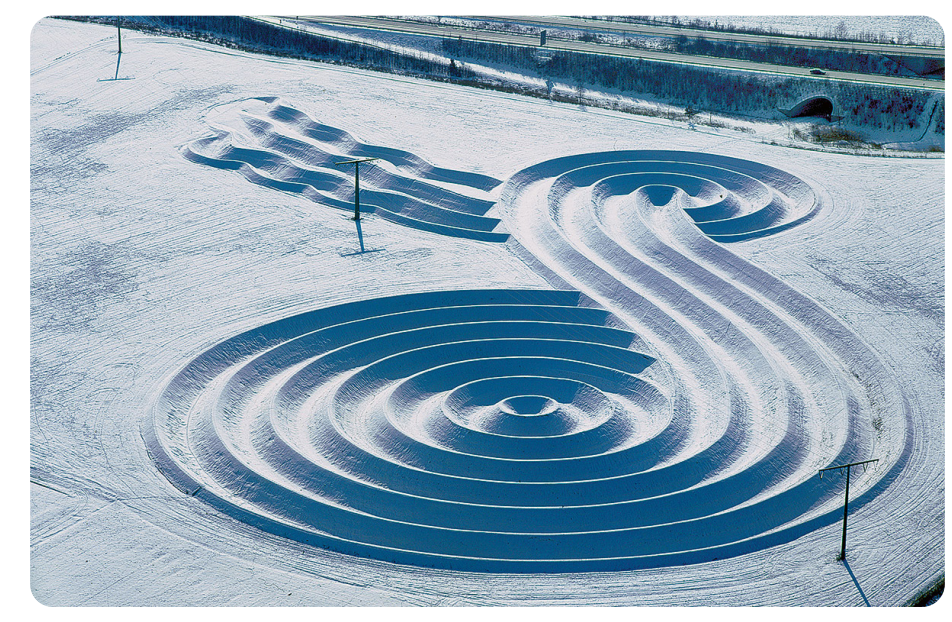
Earth Sign by Wilhelm Holderied, 1995

A relief sculpture projects from a flat surface. A high relief sculpture clearly projects out of the surface and looks like it is freestanding. A low relief, or bas-relief, sculpture does not project far out of the surface and is visibly attached to the background.