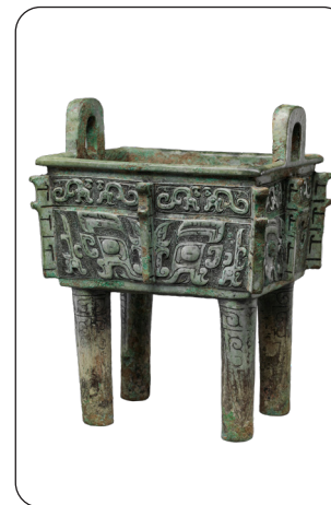
Bronze ritual vessel, c1600–c1046 BC